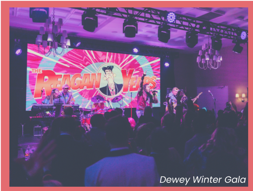
Dewey Winter Gala

We're officially counting down to summer 2023 here in Dewey Beach (117 days to go, in case you're also keeping track)! But our friends at the Rehoboth-Dewey Chamber of Commerce are making sure we're all still enjoying every day here at the beach. Whether there's sun and sand or snow and ice, there's always something fun happening in Dewey!